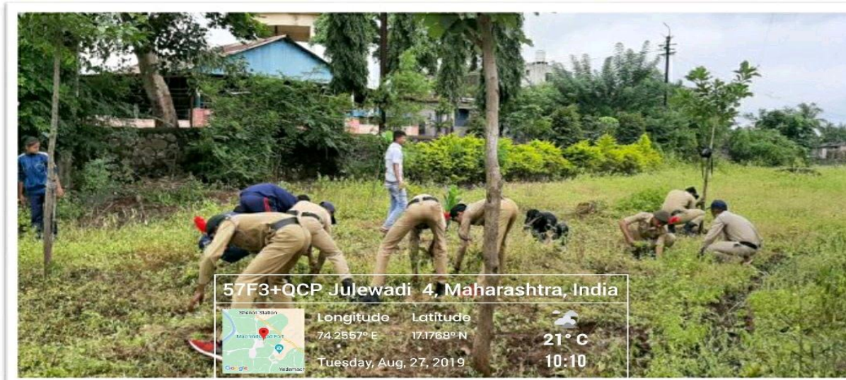
NCC Department Organized Cleanliness Campaign at the College.