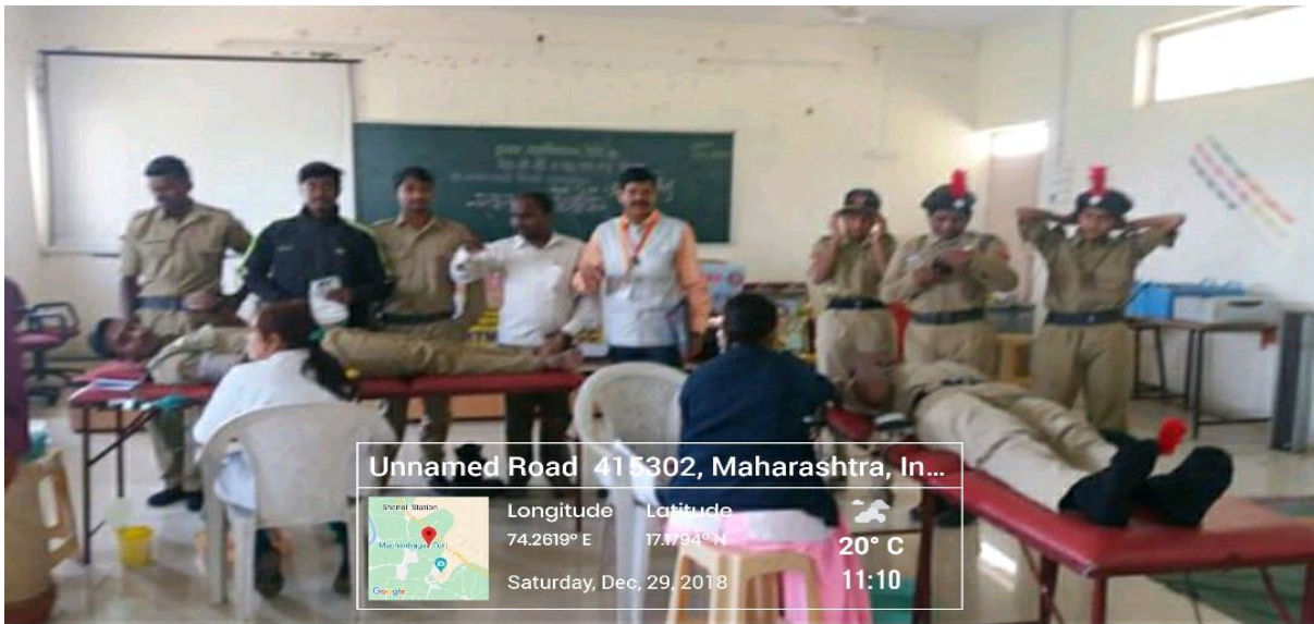
NCC Dept of Krishna Mahavidyalaya, Shivnagar and KIMS Karad Organized 'Blood Donation Camp'

Unnamed Road 415302, Maharashtra, In... Longitude 74.2619° E Latitude 17.1794° N 20° C Saturday, Dec, 29, 2018 11:10