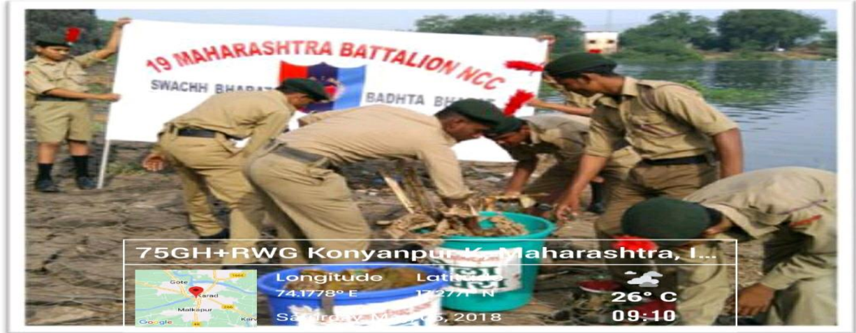
19 Mah BN NCC, Karad organized 'Clean India Campaign' on 5 th May-2018 and Clean Krishna Ghat, Hon. Late. Yashwantrao Chavan Tomb area, Karad