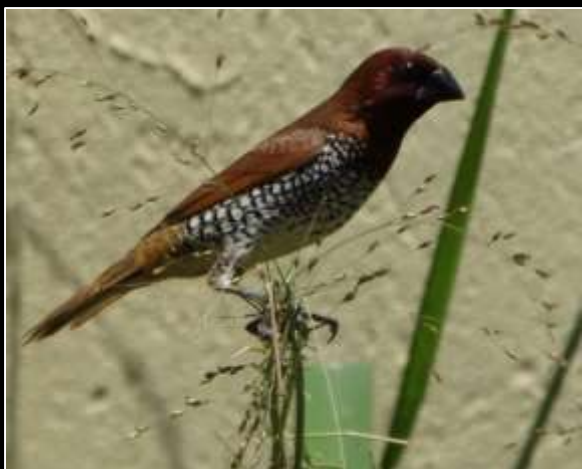
SCALY BREASTED MUNIA