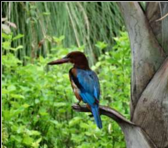
WHITE THROATED KINGFISHER