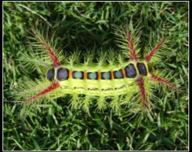
VENOMOUS SLUG CATERPILLER