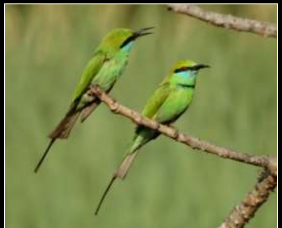
GREEN BEE EATER