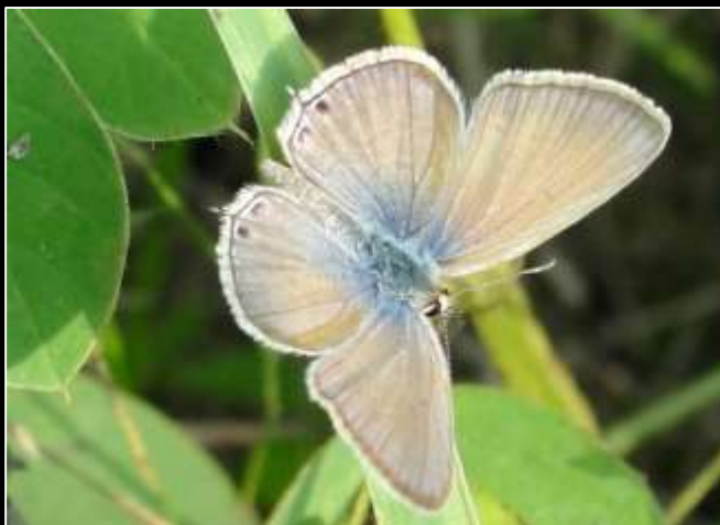
PALE OR LESSER GRASS BLUE