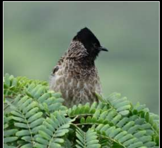
RED VENTED BULBUL