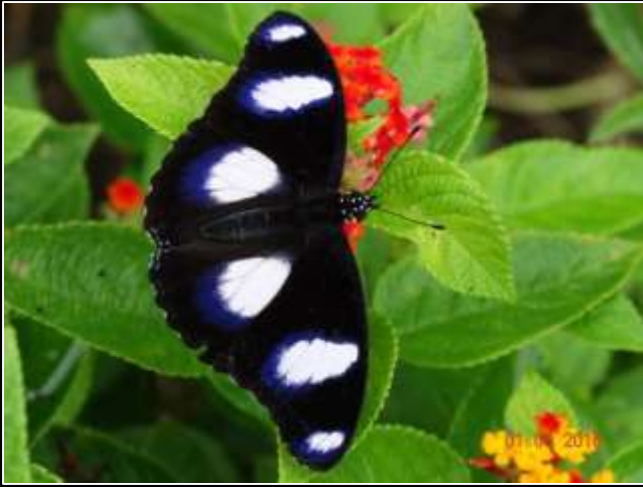
DANNED EGG FLY