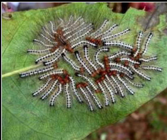
WOOLY BEAR CATERPILLERS