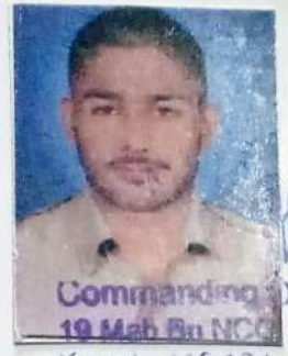
Commanding Officer 19 Mah Bn NCC Karad - 415 124