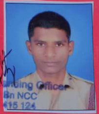
Commanding Officer 19 Mah Bn NCC Karad - 415 124