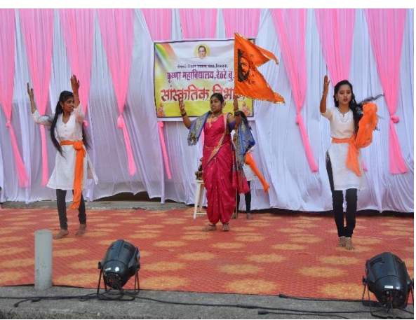
Annual Cultural Programme