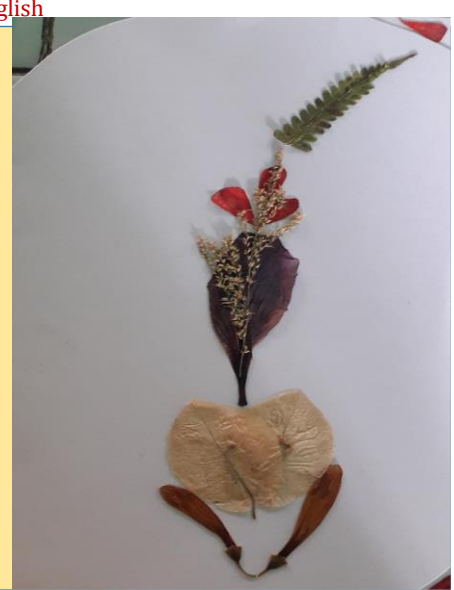
'Making Greeting Cards With Plant Parts'